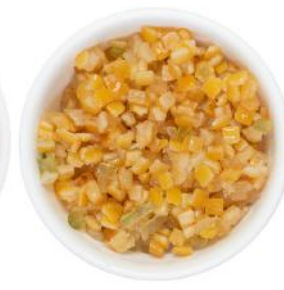
Glazed Mix Peel