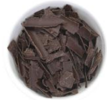
Dark Chocolate Shavings