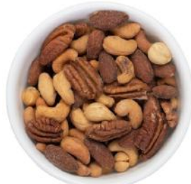
DELUXE MIX NUTS