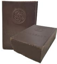
Milk or Dark Chocolate Chunks